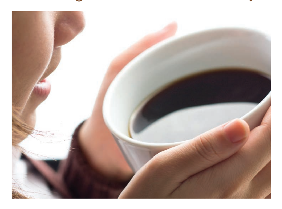
Think about this.

Steam from a coffeemaker will ruin some cabinets.