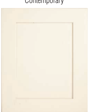
Arts & Crafts/Shaker/Mission